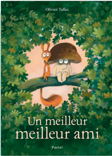
40 pages, 20 x 28 cm, softcover

Poc, the mushroom, is squirrel's very best friend. They always do everything together. That is until Momo the mosquito shows up. Can you really have two best friends?