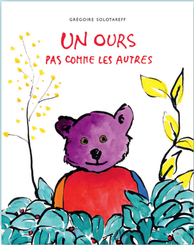
40 pages, 22 x 28 cm, softcover

With Tom away, his teddy bears are bored and fight with each other. Pacha, the multicolored bear that's become their favorite wuss, decides to leave. He soon discovers a world as colourful as he is.