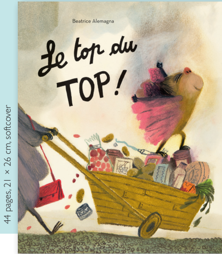
44 pages, 21 x 26 cm, softcover

At the oak supermarket, Pascaline, the little bat, wanted to buy everything: slug lollipops, cricket chips, and Bourbie dolls. Everything! And the best? Well, what is the “top du top” anyway?