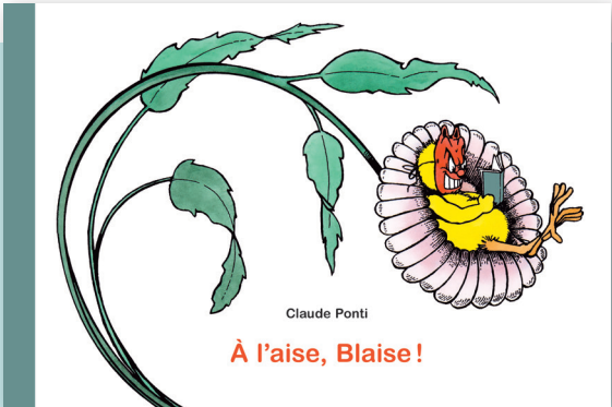
80 pages, 25.8 x 16.9 cm, softcover Abridged edition

Blaise? The famous masked chick, of course. And? In this, his encyclopedia about himself, he offers a revelation: he wrote all of Claude Ponti's books.