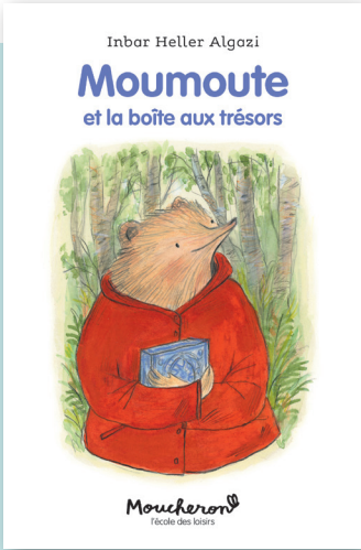
48 pages, 13.5 x 21 cm, softcover

Moumoute heads off into the forest to fill the box Mamie gave him with treasures. But neither wolf tracks or light will fit in the box. Happily the little ones are ready to help him.